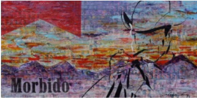
Killer Cowboy Clouds – 24×48 – 2014 – Mixed Media on Pine Panel