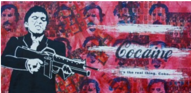
Coke. Its the Real Thing. – 24×48 – 2013 – Mixed Media on Pine Panel

I love the thrill of getting a painting to its absolute maximum point. When you paint, many times you are struggling through the middle unsure if the painting will turn out right. In many cases, its just persistent that makes the masterpiece. Another thrill is learning some new artists technique well and making it your own. At first you are simply copying, which looks terrible, but once you give it your own touch it really becomes something unusual and stunning. Another important point is to always paint with others. As an artist, you really expand and grow 2-3 times faster learning all the code that goes into their own painting.