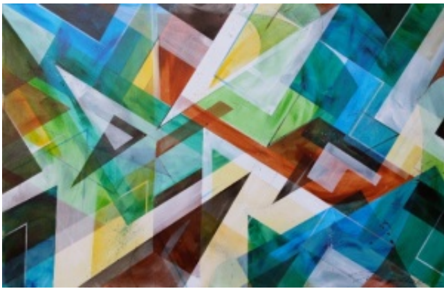
Apartheid Abolition – 43×66 – Acrylic on Canvas – 2014