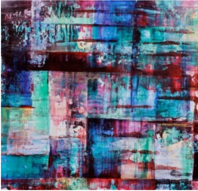
Purge of Palestine – 30×40 – 2014 – Acrylic on Pine Panel