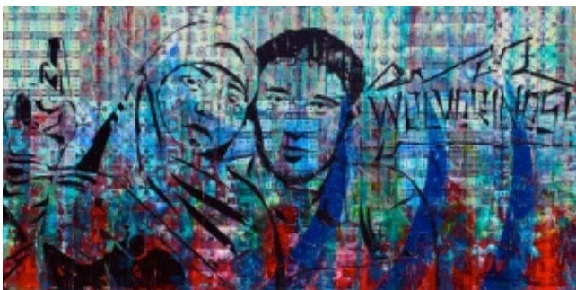
Black Widow in the Garden of Eden – 24×48 – 2014 – Mixed Media on Pine Panel